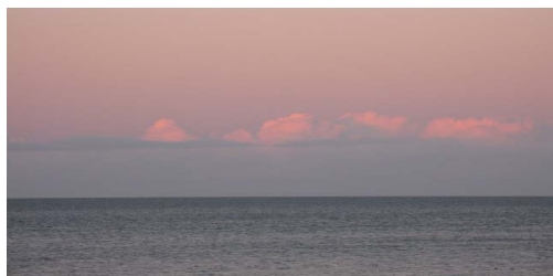
Irish see from Dun Laoghaire

Tomorrow we sleep in then head out later for strolls about town. And, of course, a tour of Guinness!