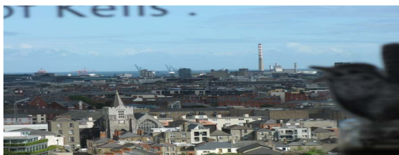
Trinity College from Guinness Bar