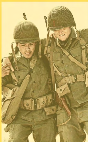
The Americans in Luxembourg in WWII