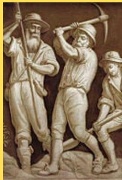
The Gold Rush and the Pacific Northwest