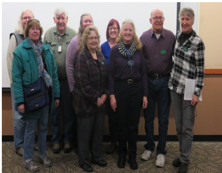
Nordic Roots Seminar Committee Volunteers