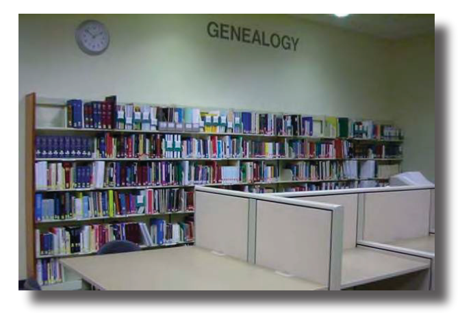
Your Guide to the SVGS Genealogy Library

T he Skagit Valley Genealogy Society (SVGS) is a non-profit organization dedicated to the study, research and promotion of genealogy and family history. We hope you enjoy browsing the library's extensive holdings of books, magazines, periodicals, family histories, notes, and media materials.